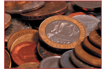
Shop around for cost savings

Self haulers may purchase recycling bins or use containers that are clearly labeled for their employee use.